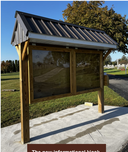
The new informational kiosk

Webster Township has one active cemetery, Webster Township Cemetery off of State Route 199 and north of State Route 105, and one inactive cemetery, Old Belleville Ridge Cemetery on the southeast corner of Carter and Dowling Roads.