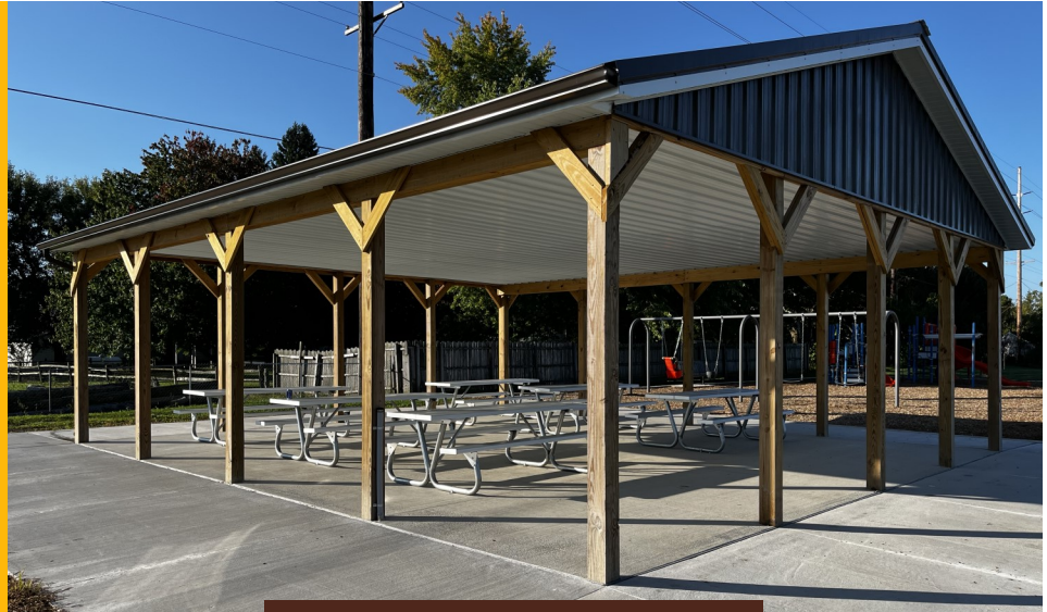
The new shelter house with picnic tables

Webster Township received $139,980 from the American Rescue Plan Act in 2021 and 2022. The township used $9,259 to purchase six picnic tables for the shelter house and has allocated up to $129,000 towards the purchase of a new Volvo truck. The remaining funds must be allocated by the end of 2024 and must be spent by the end of 2026.