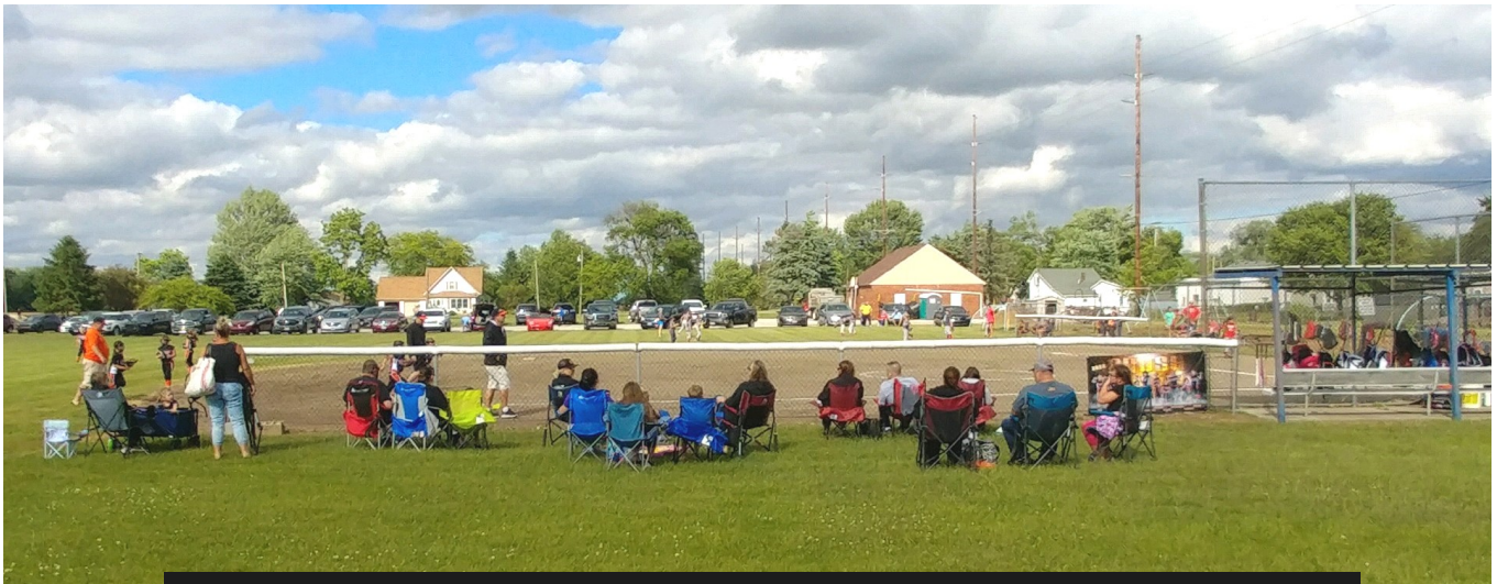
Multiple days a week, the ball diamonds are occupied, the parking lot is full, and parents line the fences